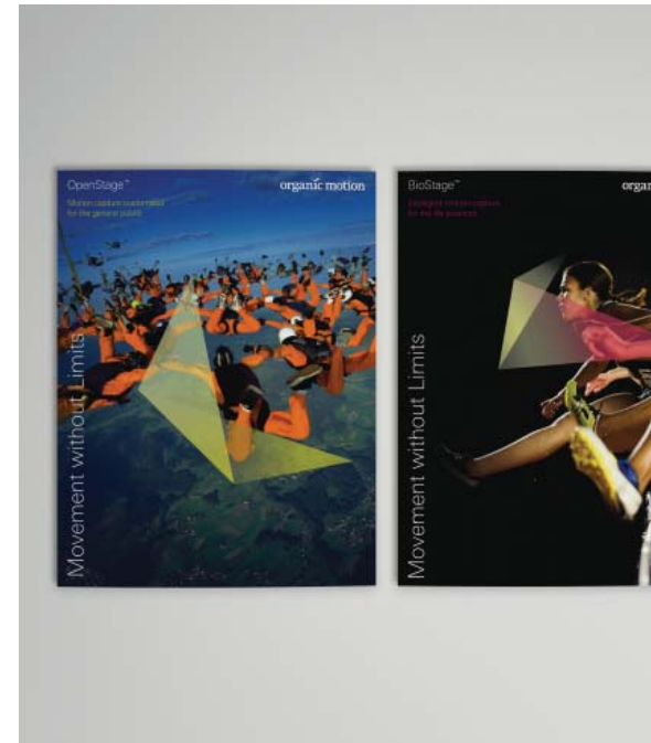
Organic Motion Visual Design System

"Method immediately understood the core essence of what Organic Motion wanted to be, its market and the specific value in our motion-capture solution itself," remarked Andrew Tschenok, Organic Motion's Founder and CEO. "From our earliest brainstorming sessions around product naming, to determining the focus and depth of our brand experience, Method challenged us in the best way possible. The results are tremendous and, as evidenced in our current market position, we are reaping the benefits. We are looking forward to continuing our relationship with Method in the future as we work to attract more customers who seek to create truly immersive experiences."